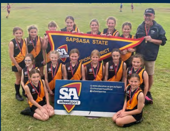
Sapsasa State Aussie Rules team

Next Monday we have 5 boys and 3 girls attending Sapsasa Soccer trials and we wish them all the best in their endeavours to win selection in their respective teams.