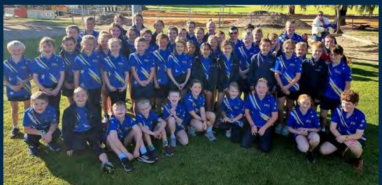
Sapsasa Cross country team